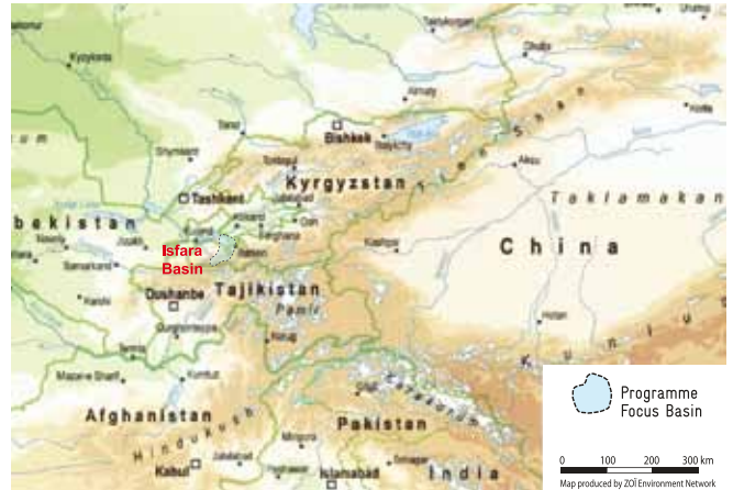
Isfara river basin.

In this regard, trainings organised by the programme have improved the skills of partners in processing digital data for an effective basin planning, to be finished by 2014. The first outcomes were land use maps, mudflow hazard maps and flood hazard maps for the draft basin catchment border of the Isfara River. Representatives of local water management organisations are being supported in the drafting of the basin plan involving stakeholders from other state agencies representing related